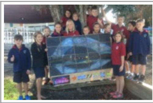
Matariki artwork - representing working together, Room 11 created this piece of Matariki artwork.