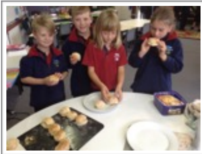
Room 6 had fun making bread buns recently during our science session.