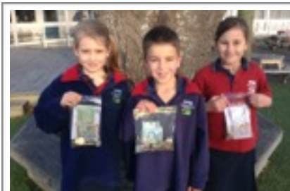
Well done to all those who have already bought in their 20 hour famine money. Remember all money due in by Friday 8 July