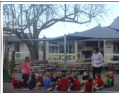
Loving the beautiful weather at present - an ideal time to be outside. Room 4 & 5 enjoying a maths lesson.